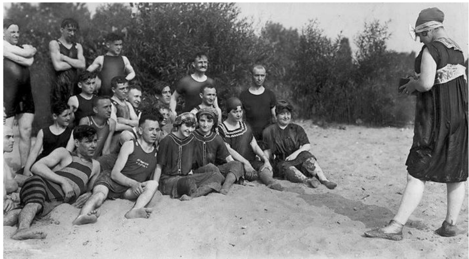
Hanlan's Point beach, 1913