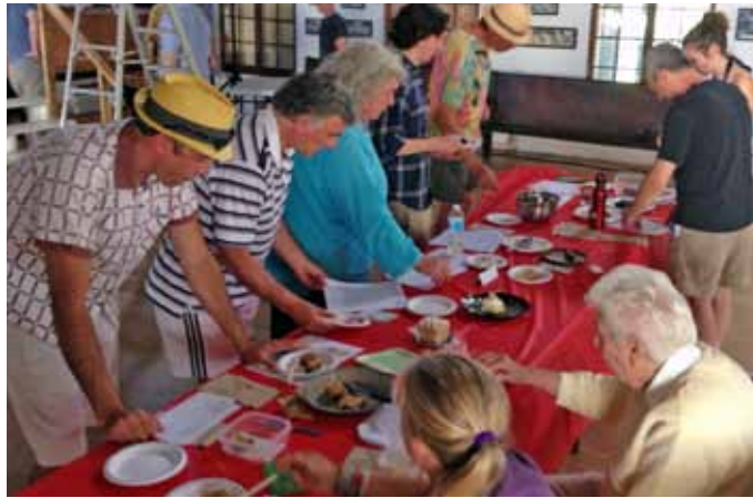
Dessert Judges hard at work