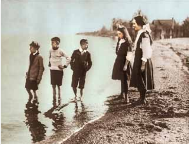
SANDBAR ACROSS THE BAY A Century of Life on Ward's Island